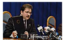
EU's Action Plan for Moldova proposed for adoption